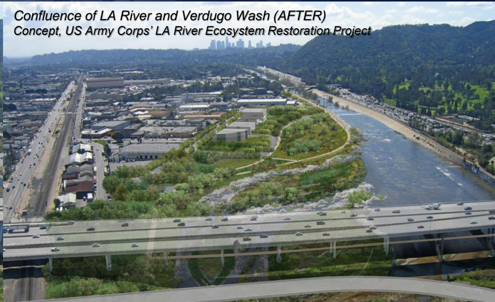
Confluence of LA River and Verdugo Wash (AFTER) Concept, US Army Corps' LA River Ecosystem Restoration Project