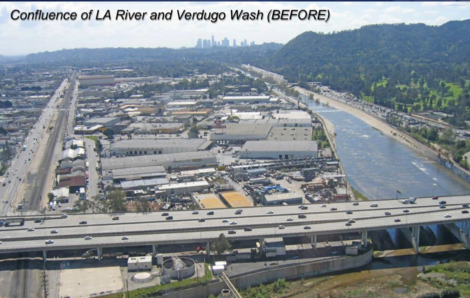
Confluence of LA River and Verdugo Wash (BEFORE)