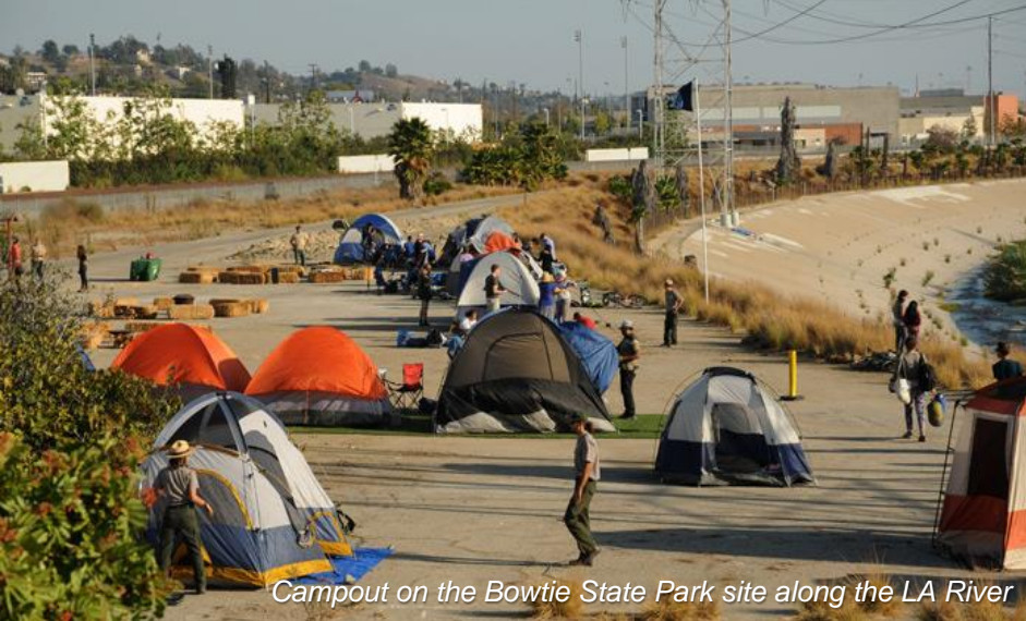
Campout on the Bowtie State Park site along the LA River