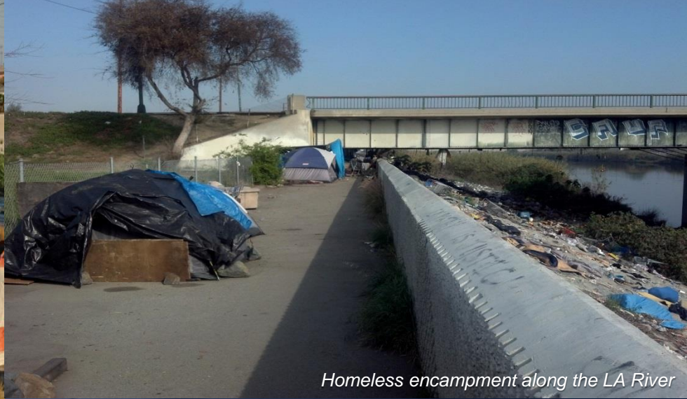
Homeless encampment along the LA River